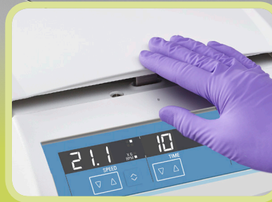
Fast one-click centrifuge lid closure