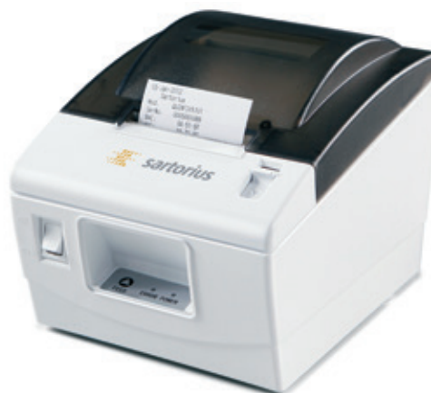
Plug & Play Standard printer YDP40

Two large, easy-to-adjust feet and an outstandingly simple-to-read level indicator on the front make it a breeze for you to level the Practum®. This helps ensure accurate, repeatable weighing results.